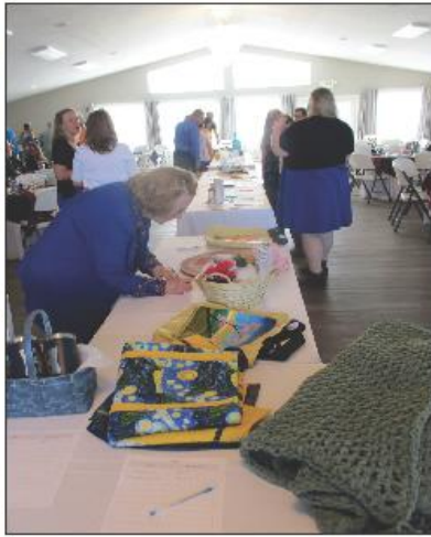
A long table full of items for sale in the silent auction at Family Promise of Barry County's 2023 Gala in Nashville on Thursday night.

Family Promise works with families that are experiencing homelessness, providing them with a roof over their heads while equipping them with the resources needed to embark on a future life of independence. The organization in Barry County was founded back in 2019 after