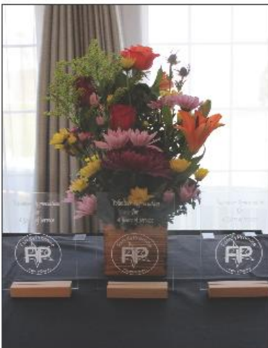
Three Volunteer Appreciation Awards sitting on a table at the start of the Family Promise of Barry County Gala.