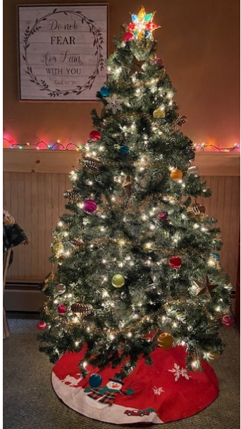
Above: Our Christmas tree in our living room.

We are blessed to be able to provide a warm, safe, and homey place for our families to celebrate this holiday. We couldn't do this without the steadfast support of our community!